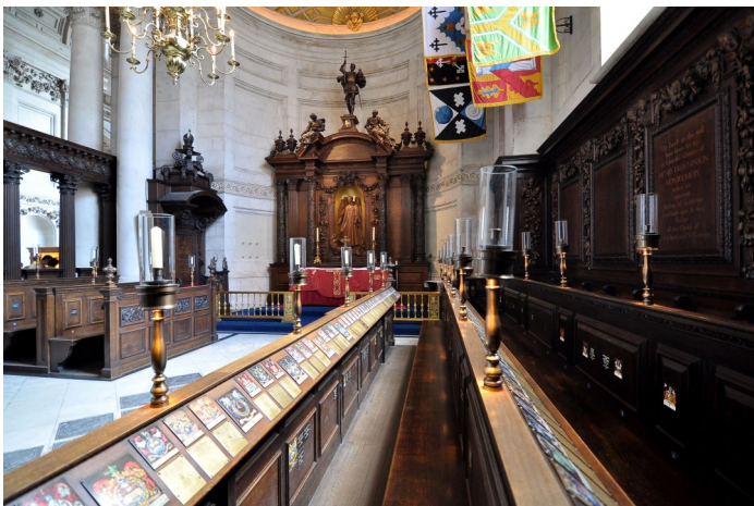
The Chapel of the Order of St Michael and St George

It should be noted, however, that the Chapel of the Order is not ideal for a Wedding. It is sometimes noisy due to its position in the main body of the Cathedral which is open to visitors. It also has limited seating and musical facilities. Members may be offered the use of St. Faith's Chapel in the Crypt as an alternative. St. Faith's Chapel is more conducive to a Marriage Service being situated away from the general public and having a good seating capacity at approximately 350. The decision as to which Chapel may be used rests finally with the Dean.